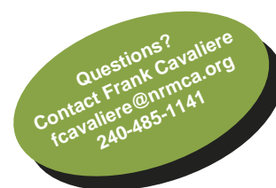
Exhibit Space Preference

Every attempt will be made to meet the space preferences you have requested to ensure your success at the 2010 Concrete Sustainability Conference Please list your space preferences below using the Exhibit Hall Floor Plan.